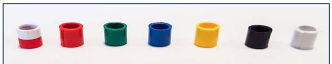
Sparrows are wearing 7 possible color bands: red/white split, red, green, blue, yellow, black, and white.

Send us an email , post on our Facebook page , or include Ipswich Sparrows on an eBird checklist and describe the colored bands in the comments.