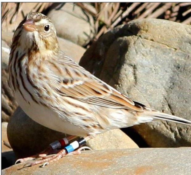
Ipswich Sparrow with red/white split over aluminum bands on the right leg, and black, white, and blue bands on the left leg (Photo: D. Currie).